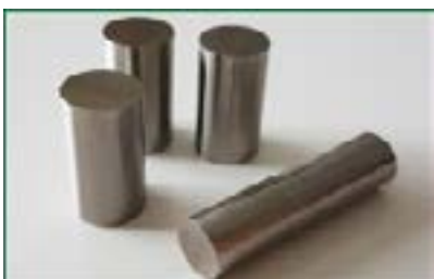
Precise Abrasive Cutoff with Minimal Burr