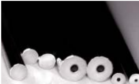
Electrochemical Cutoff for Burr-Free Tube or Wire Cutoff