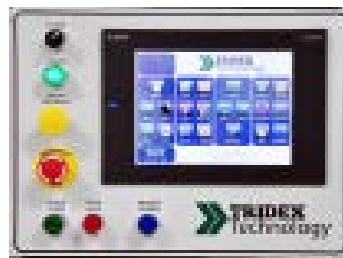
Intuitive User Interface with Color Touch Screen