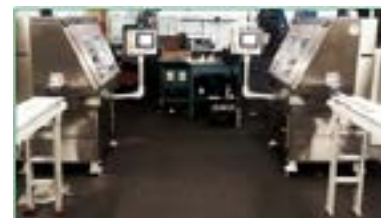
Right or Left Hand Feed for Work Cells