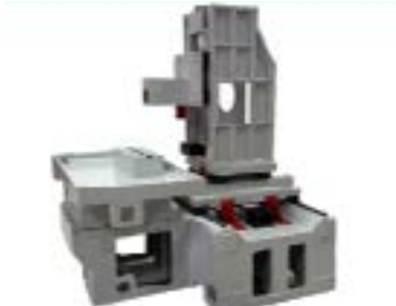
Stable Gray Iron Castings for High Precision