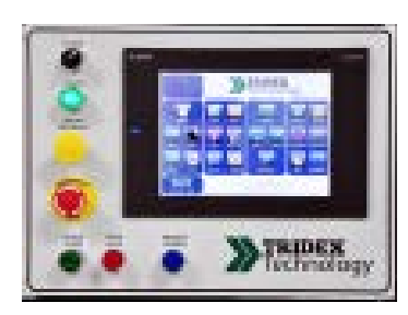
Intuitive User Interface with Color Touch Screen