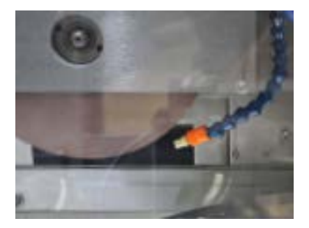
High Precision Spindle