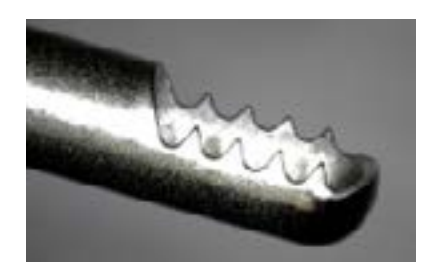
ECG for Burr-Free Grinding Applications